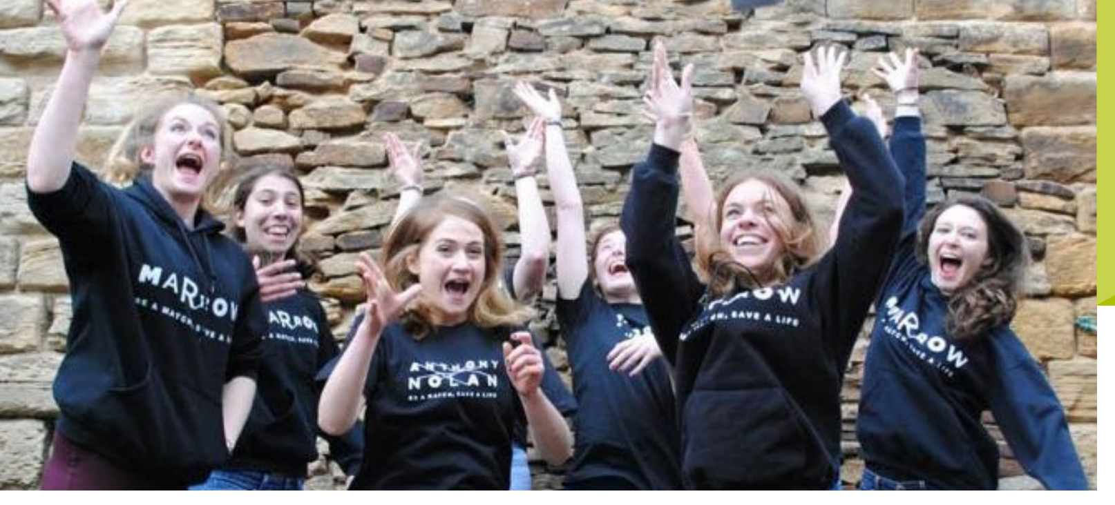
Students from our university programme, Marrow.

This midway point in the Organisational Strategy is the perfect time to reflect on the strides that have been made and the wealth of tangible successes, whilst remaining mindful of the fact we still have more to achieve over the coming years: