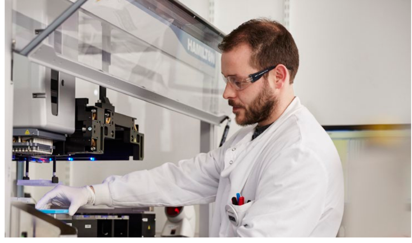
A Clinical Scientist starts the TGS process on a Hamilton Microlab STAR Robot.

Anthony Nolan is a registered charity and a company limited by guarantee incorporated in England and Wales, not having share capital. Every member undertakes to contribute an amount not